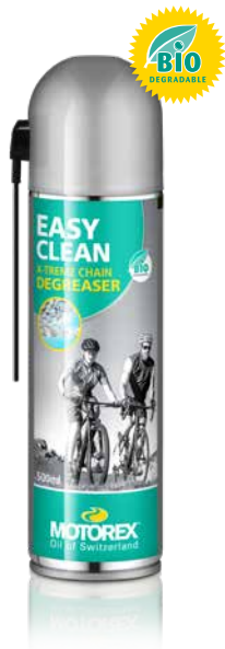
Biodegradable chain cleaner

✓ Our Tip: If you are maintaining your bike on a sensitive surface, cover it so that it will not become soiled. Cardboard is a good idea and readily available.